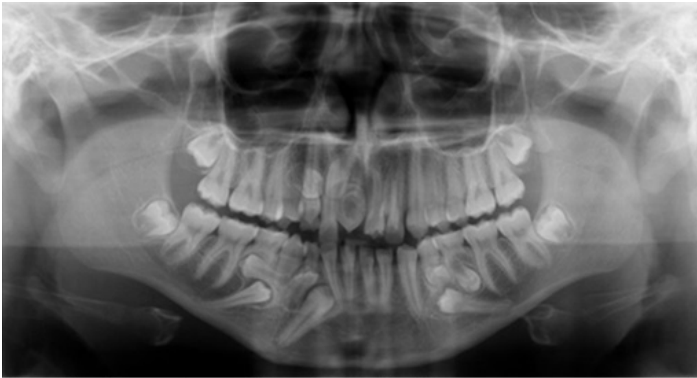
Fig. 1. Panoramic radiograph highlighting supernumerary teeth (yellow), both mesiodens included, and impacted permanent teeth (black). The unusual morphology of the mesiodens located to the right side can.

A 14-year-old white male patient was referred to a private Dental Radiology clinic for radiographic examination in order to evaluate the cause of abnormal tooth eruption in the mandible and anterior region of the maxilla. It was observed, on panoramic radiograph (Fig. 1), the presence of seven supernumerary teeth. Three supernumerary teeth in the maxilla: two mesiodens erupted in the central incisors region, and one unerupted between right canine and first premolar. As well as four unerupted supernumerary in the mandibular premolar area: two on the left side and two on the right side. Root development criteria was used in order to identify the permanent teeth located bilaterally on mandibular premolar area (Fig. 1). The mesiodens erupted on the right side drew attention due to its abnormal morphology, presenting an oval shaped structure with a central radiolucent shadow.