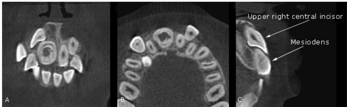
Fig. 2. Axial (A), coronal (B) and sagittal (C) reconstructions showing a mesiodens with an invagination.

Axial, coronal and sagittal reconstructions also revealed compression of the pulp chamber and discrete communication with the invagination in the middle third of the root on mesial surface. It was also detected the presence of calcified focus inside the invagination, as well as an osteolytic image in the periapical region of the affected tooth (Fig. 3). The diagnosis, based on the CBCT images of the examined tooth, was dilated Odontoma shaped dens in dente Type II in an impacted mesiodens. The patient was, then, referred to a bucomaxillofacial surgery private service for surgical treatment.