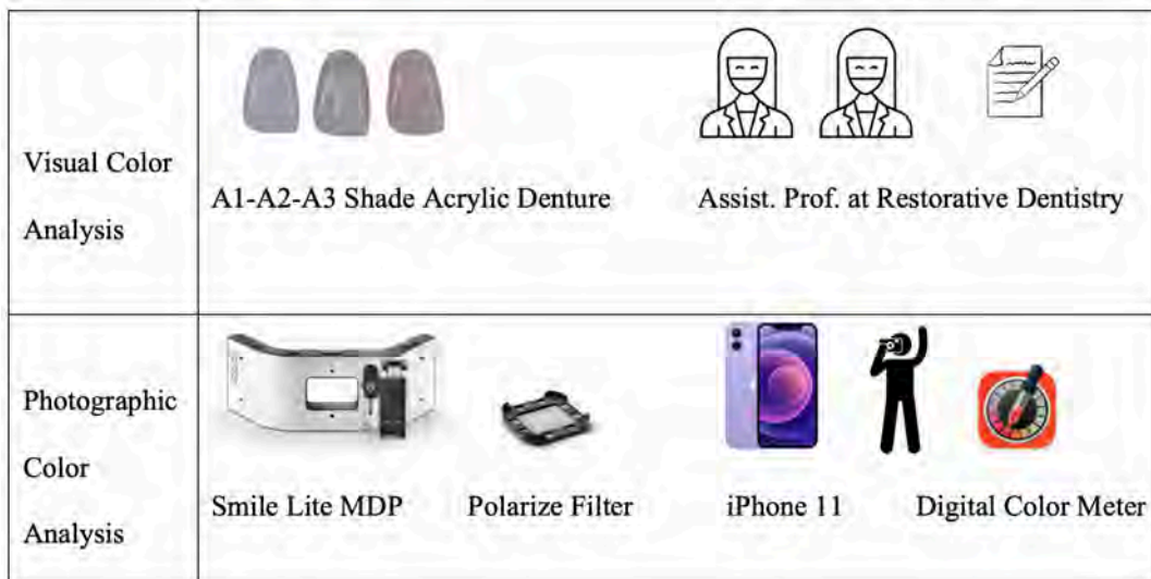
Figure 2. Color analysis procedures.