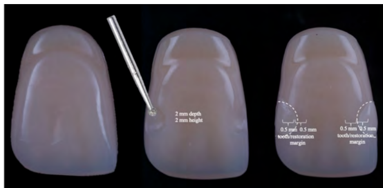
Figure 1. Representative image of class III preparations, and color acquisition. Two different color measurements were performed: 0.5mm away from the tooth/restoration margin for each restoration and tooth.

There were no significant differences between materials and scores in the A1 and A3 shade groups ( p > 0.05 ). There were statistically significant differences between the materials and the scores in the A2 shade groups ( p < 0.05 ). The highest “0” score was seen in the VU group (33.3%), and the highest “1” score was observed in the O (91.7%) and EA (91.7%) groups.