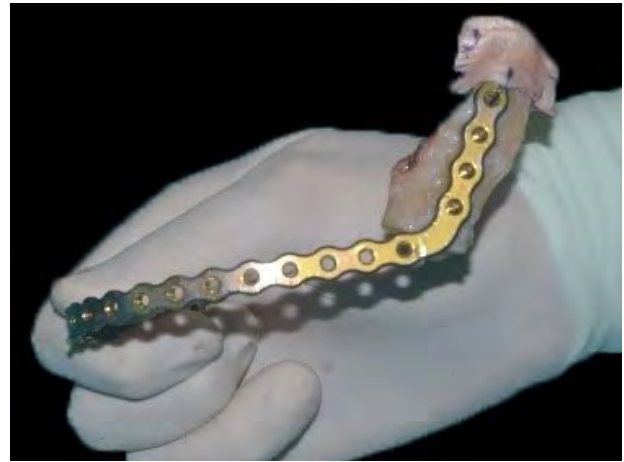
Figure 3. Lateral view of bone graft with reconstruction plate.

Subsequently, the musculature was disinserted and the left hemimandible was resected considering the margin anterior or proximal to piece 44. Once the defect was exposed, the operating field was cleaned with a saline solution and hemostasis was promoted. The mandibular reconstruction was performed using a costochondral graft plus fascia lata to replace the condyle and joint. Maxillomandibular fixation was then performed and the osteosynthesis material was fixed with the reconstruction plate (Figure 3). After that, the flap was repositioned and closed from the facial planes. Pharmacological treatment consisted of intravenous administration of vancomycin 500 mg every 12 h and meropenem 1 g every 8 h for 12 days. After discharge, the patient continued oral treatment with clindamycin 300 mg every 6 h for 14 days and then with ciprofloxacin 500 mg every 12 h for 14 days. Periodic controls were performed every six months with a favourable clinical evolution of the patient. Figure 4 shows the follow-up at 3 years and 7 months after surgery.