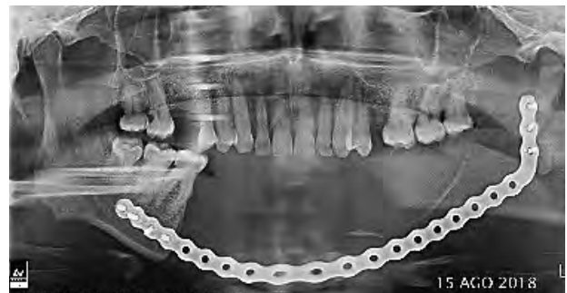
Figure 4. Annual postoperative control orthopantomography.

Subsequently, the musculature was disinserted and the left hemimandible was resected considering the margin anterior or proximal to piece 44. Once the defect was exposed, the operating field was cleaned with a saline solution and hemostasis was promoted. The mandibular reconstruction was performed using a costochondral graft plus fascia lata to replace the condyle and joint. Maxillomandibular fixation was then performed and the osteosynthesis material was fixed with the reconstruction plate (Figure 3). After that, the flap was repositioned and closed from the facial planes. Pharmacological treatment consisted of intravenous administration of vancomycin 500 mg every 12 h and meropenem 1 g every 8 h for 12 days. After discharge, the patient continued oral treatment with clindamycin 300 mg every 6 h for 14 days and then with ciprofloxacin 500 mg every 12 h for 14 days. Periodic controls were performed every six months with a favourable clinical evolution of the patient. Figure 4 shows the follow-up at 3 years and 7 months after surgery.