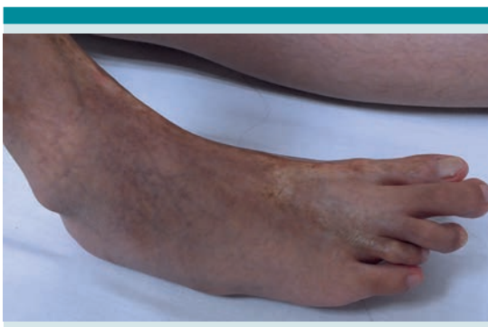
Figure 4. Sclerotic morphea plaque on the right foot, with reduction in length and joint contractures and loss of mobility in the first and fourth toes.

(34%), and joint contractures (38%) ( Figure 4 ). Only nine patients (28.1%) did not report musculoskeletal manifestations. Twenty-eight percent ( n = 9 ) of patients had neurological manifestations; the most common symptom was headache in 22% ( n = 7 ). There was no report of targeted questioning on symptoms for 6% of the patients and related paraclinical studies were not conducted for 81%. Six patients underwent neurological studies. One patient with linear morphea in the upper left extremity, with seizures underwent: nuclear magnetic resonance (NMR), computed tomography (CT) of the skull, and electroencephalogram (EEG), documenting mild cortical atrophy and epileptic activity. Another patient with linear morphea in the hemiface suffered headaches and underwent a simple CT scan which found osseous atrophy. In most patients there were no reports of ophthalmological manifestations in notes to the clinical file (78%), only three patients had clinical alterations: hemihypertrophy, strabismus, exotropia, and keratitis. Table 2