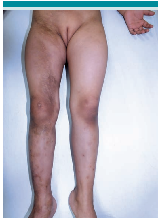
Figure 1. Patient with linear morphea in the lower right extremity, with visible sclerosis, changes of pigmentation, and mild atrophy.

Approximately 40% of children with morphea present extracutaneous manifestations: arthritis, neurological symptoms (headache, seizures), vascular disorders (Raynaud's phenomenon), ocular disorders (uveitis or episcleritis, mainly of the linear variety, in the head or en coup de sabre ) and gastrointestinal and respiratory symptoms. The association between location or type of morphea lesions in the skin and the risk of extracutaneous manifestations is unknown, as are risk factors which predispose an individual to its appearance. 7