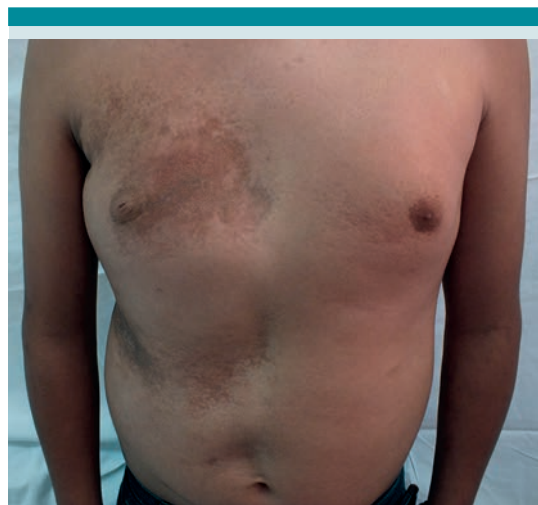
Figure 2. Patient with plaque morphea in the anterior torso, with irregular shaped plaques with dermal atrophy and visible blood vessels.

Fifty-nine patient files were located and 27 were discarded because they did not meet the criteria for inclusion. Thus, 32 patients with the diagnosis of morphea were included; females predominated, at 69% (n = 22). The linear morphea subtype was the most common, at 50% (n = 16) ( Figure 1 ), followed by plaque morphea at 22% (n = 7) ( Figure 2 ). The median age at initial manifestations was 9 years, with a range of 1 to 16 years. Morphea lesions had characteristics of lichen sclerosus and atrophicus in 41% (n = 16) of the cases; deep in 25% (n = 8), and with atrophoderma in 22% (n = 7). Table 1