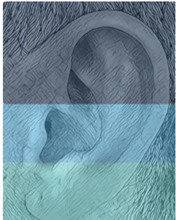
Figure 1. Division of the pinna by thirds: The upper third of the superior border of the helix to the root of the helix, the middle third of the root of the antihelix to the intertragic notch and, finally, the lower third from the intertragic fissure to the inferior border of the lobe.

In order to perform a proper diagnosis, it is also important to know the anthropometric measurements of the pinna. The average height is from 6 to 5.5 cm and the width is 50% to 60% of the height; the distance from the mastoid to helix in the upper part is from 10 to 12 mm; in the middle part, it is 16 to 18 mm; in the lower part, it is 20 to 22 mm; and, finally, the conchomastoid and concha-scaploid angles are 90 degrees, and the auriculocephalic angle is between 25 and 35 degrees Figure 2A-C (6).