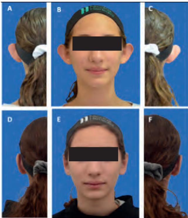
Figure 5. A-C. Preoperative photographs. D-F. Postoperative photographs.

Nowadays, there are more than 170 surgical techniques of aesthetic otoplasty described in the literature, which consist, mainly, of multiple combinations between cartilage resection and preservation techniques. Hybrid techniques that combine both types of approaches may have better aesthetic outcomes, since by making partial-thickness cuts in the cartilage, they decrease the resistance of cartilage to deformation and, consequently, reduce the recurrence rate; however, as they are not complete cuts, there is a lower risk of contour irregularities (1, 12).