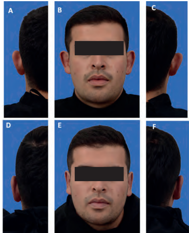
Figure 4. A-C. Preoperative photographs. D-F. Postoperative photographs.

The classic objectives of otoplasty were described by McDowell in 1968 and are as follows: